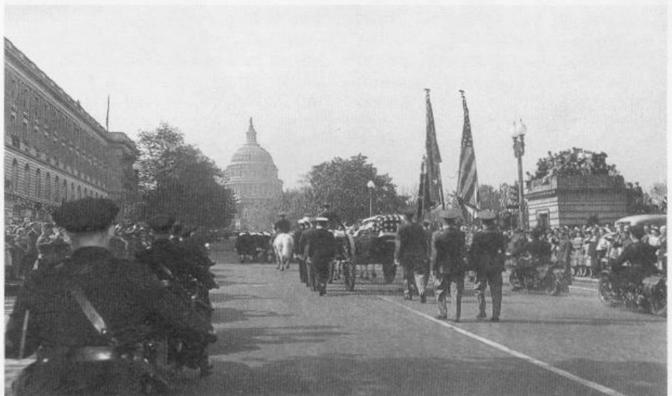
The President's casket makes its way toward Union Station and the trip home.